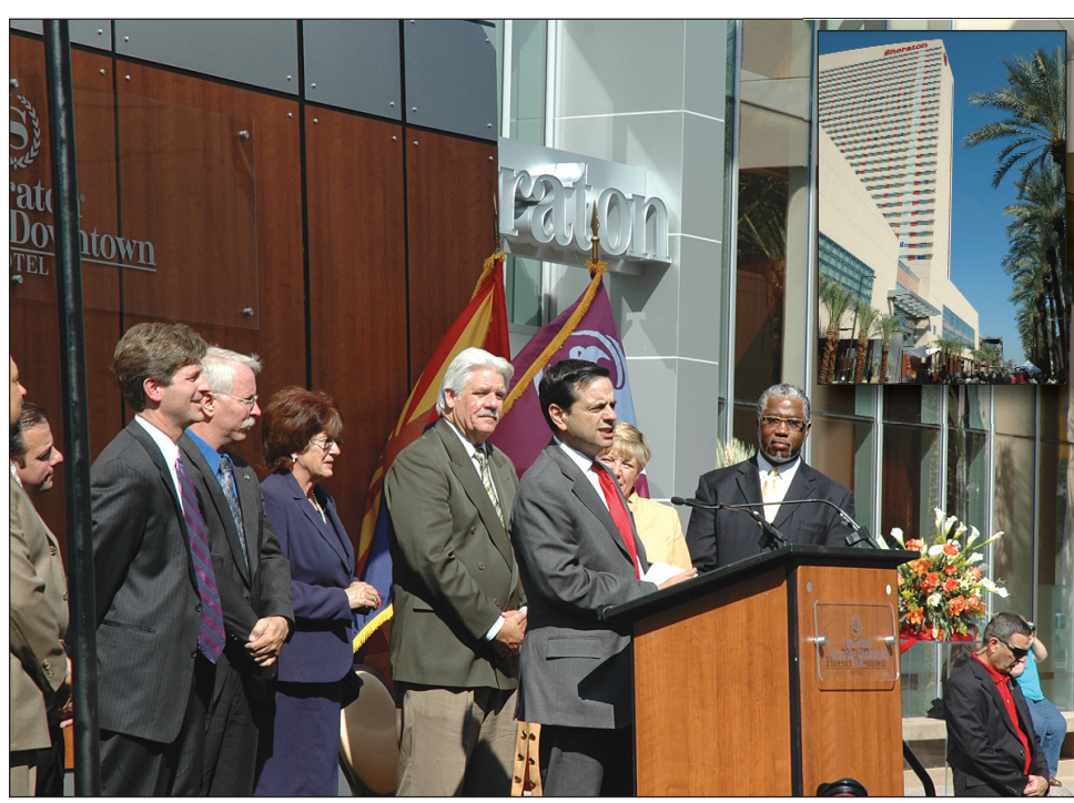
Phoenix Mayor Phil Gordon, officials and hundreds of spectators attended the official opening of the Downtown Sheraton on Oct. 1.

The finished project is designed to reflect its environment; even the architecture of the structure was engineered to echo the unique southwestern surrounding. The "cloud-like" white rooftop turns translucent